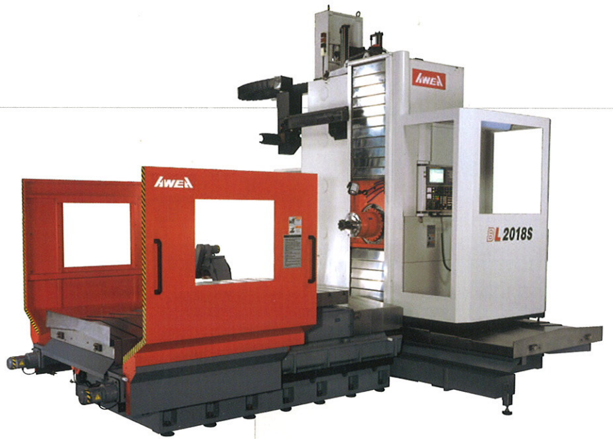
Machine side view