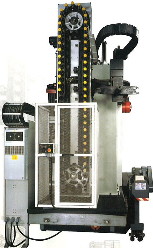
ATC Magazine view